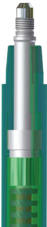
Dexter UnderCurrent™ Downhole Turbine Generator

Co-developed with Noble Downhole Technology