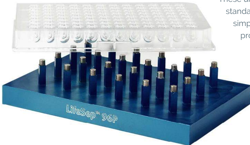
Force Density Plot of LifeSep 96P MX

These units are designed to accommodate industry standard microtitre plates. Our LifeSep™ technology is simple and easy to use with the most established protocols.