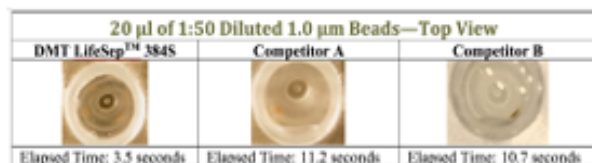
Table 1: Competitor Analysis for Separation Speeds

DMT continues to advance its technology and leverage customer needs based on what the end user is striving to achieve. Magnetic separation, therefore, continues to improve, but even more, DMT has designed prototypes for a magnetic resuspension device that re-mixes the particles after they have been separated. One of the prototypes is displayed in Fig. 2.